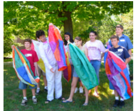
Campers before their first balloon flight.

The campers spent the remaining time building their cars in preparation for races to take place later in the week.