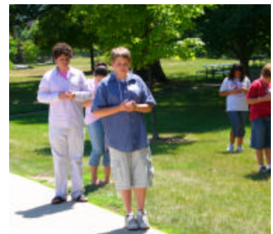
Campers try to find their way